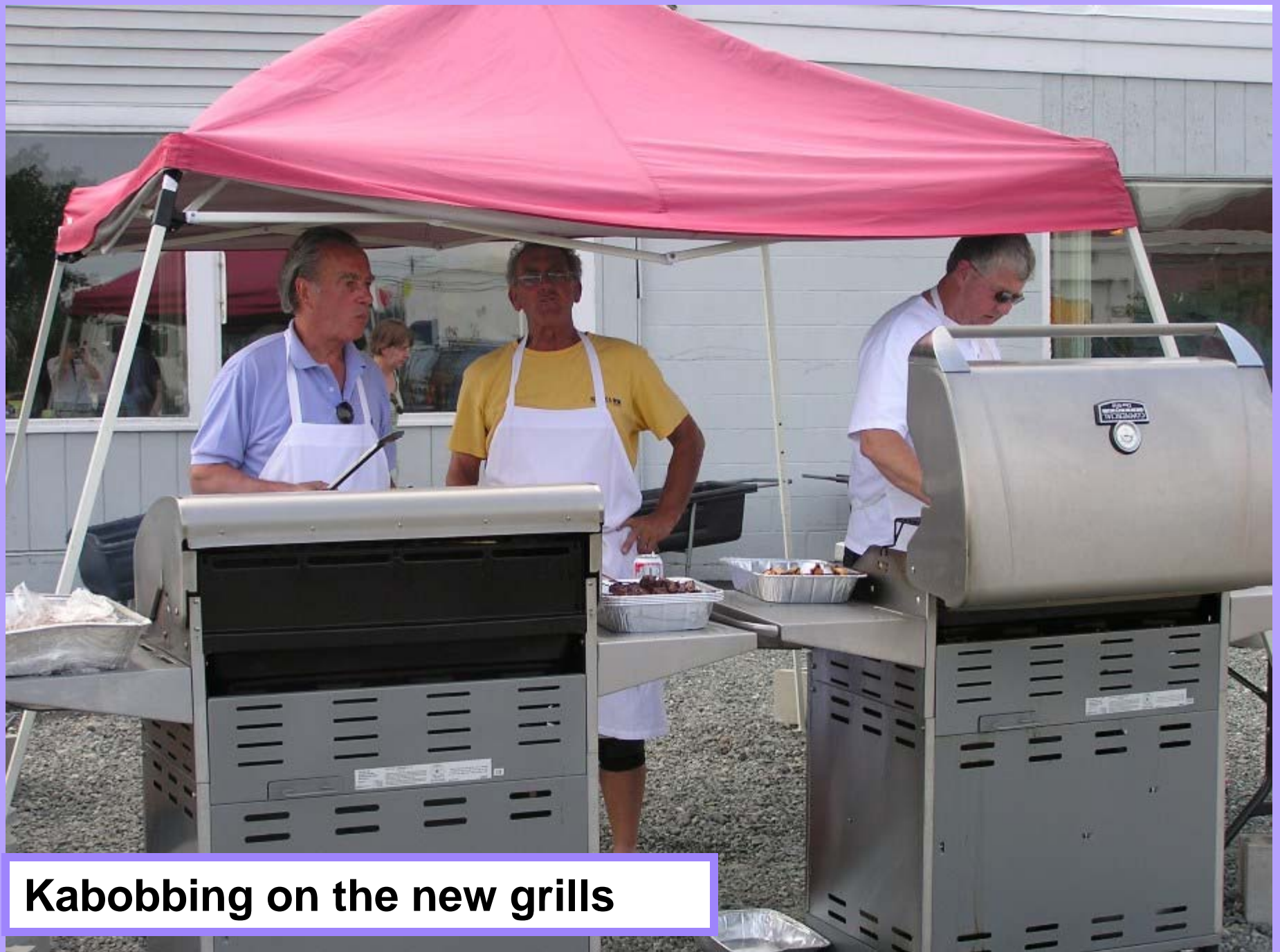
Kabobbing on the new grills