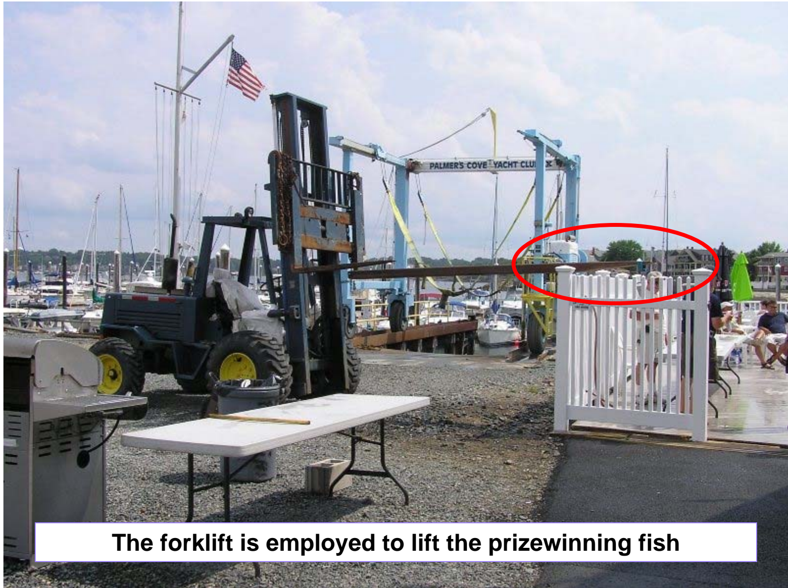
The forklift is employed to lift the prizewinning fish