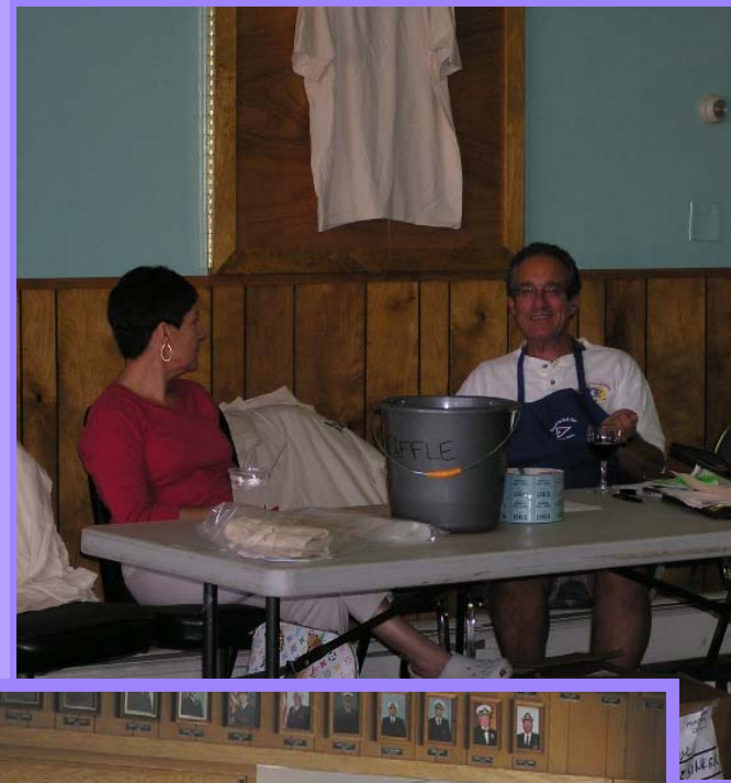
Tournament shirt sales and raffles begin the festivities